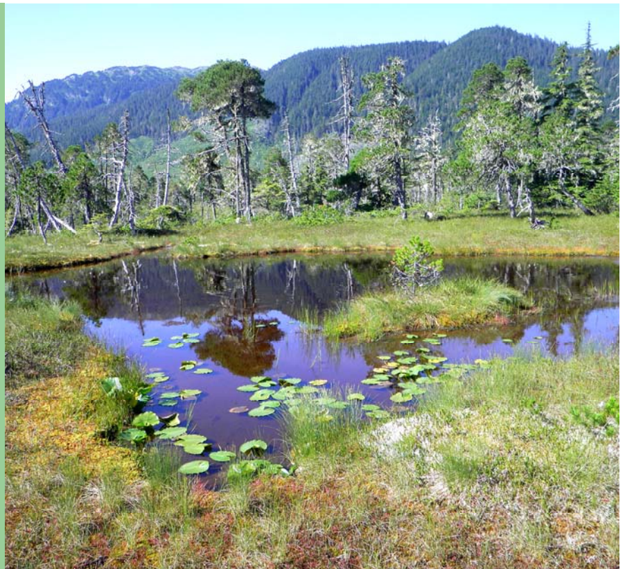
Wetland Calibration site for WESPAK-SE in Hoonah, AK