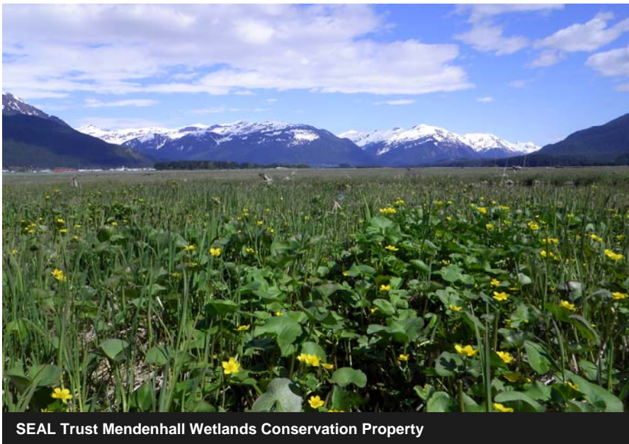
SEAL Trust Mendenhall Wetlands Conservation Property