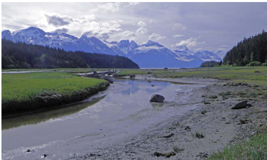
Nelson Homestead Conservation Easement in Haines, AK